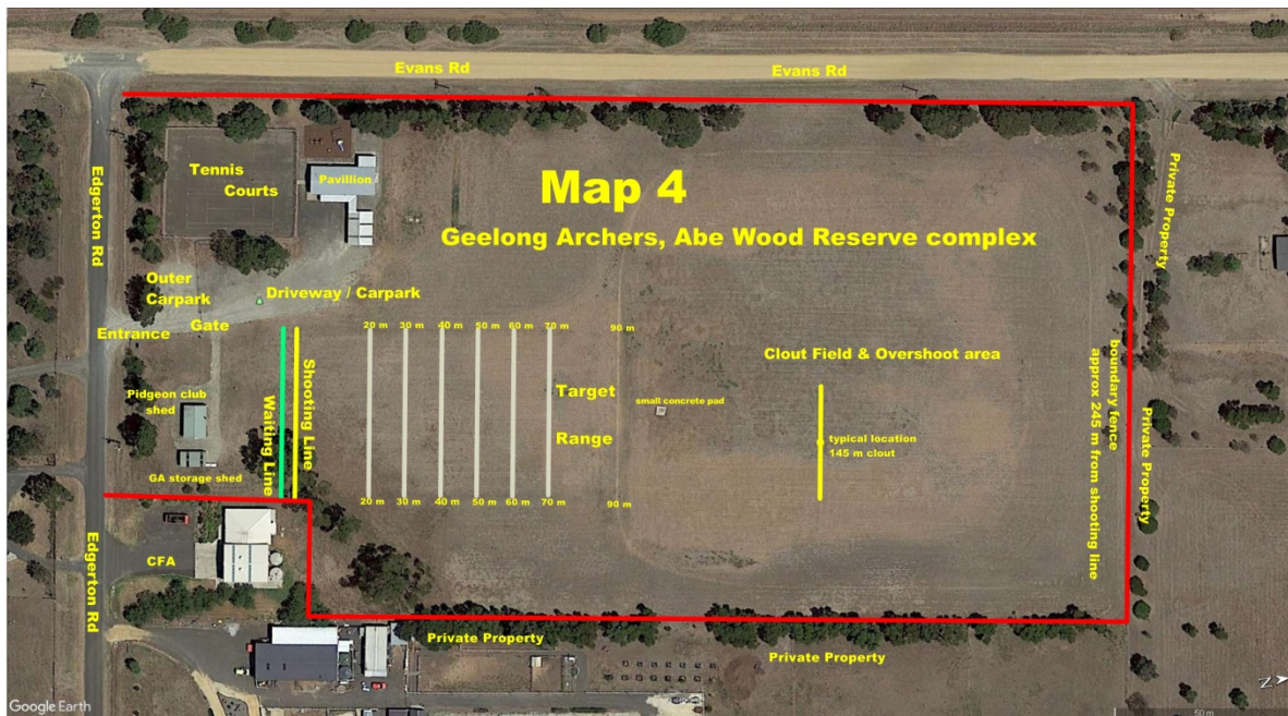
Map 4 Geelong Archers Abe Wood Reserve complex.

Historically the venue of Corio Bay Archery Club, this ground is now used by Geelong Archers as a second Target Archery Range, and for Clout. This Council Reserve is leased from the City of Greater Geelong Council, (CoGG). The club shares the facilities with a Pigeon Club, a 4WD (Four Wheel Driving) Club and a Dancing Club. GA has sole use of a small storage shed beside the Pigeon club's shed, and has use of the pavilion, when not in use by the 4WD and Dance clubs. Toilet facilities are available at blocks adjoining the pavilion.